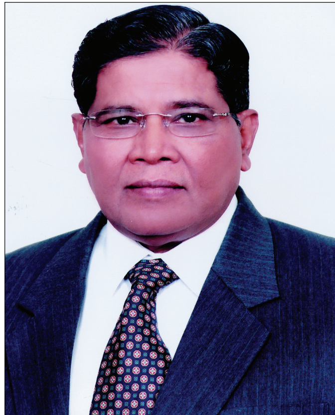
Shri K. Rahman Khan, Deputy Chairman, Rajya Sabha