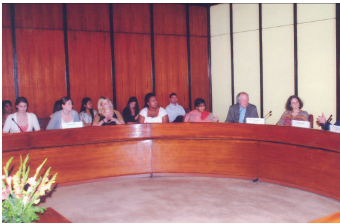
Visit of the Professors and students of the Touro College, Law Center, New York, USA to the Rajya Sabha Secretariat on 3 June 2011